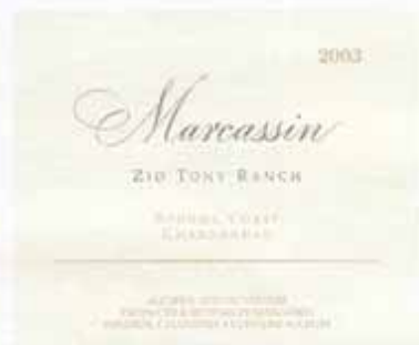
Marcassin Chardonnay Sonoma Coast Zio Tony Ranch 2003 96 POINTS, $75