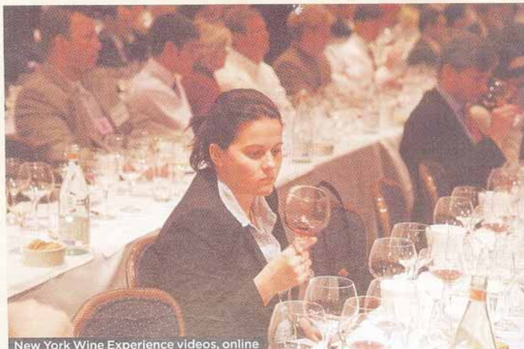
New York Wine Experience videos, online

TAKE THE CHALLENGE We're putting your wine knowledge to the test with our fun, new biweekly wine quiz. See how well you do compared with other readers.