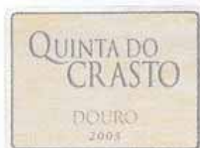
Vinha Maria Teresa